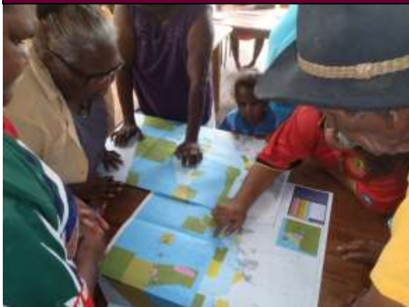
Kuku Nyungkal Bama reviewing plans on-Country at Rossville